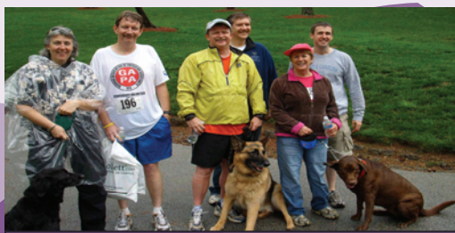
Our faculty looking spiffy at the 2008 FunRun

cifically towards providing diabetic supplies for indigent patients. We hope you will be able to join us for this event or make a donation towards the Fun Run proceeds. If you are interested in corporate sponsorships and/or donating products for door prizes at the event or have questions, please e-mail abcastl@emory.edu . We very much appreciate your support for this important fundraising event! Go to : http://www.active.com/running/atlanta-ga/emory-pa-9th-annual-care-to-share-5k-fun-run-and-kids-mile-2010 to view the run details as well as register for the run. Or go to http://www.active.com/donate/emorypafunrun2010 to make an online donation.